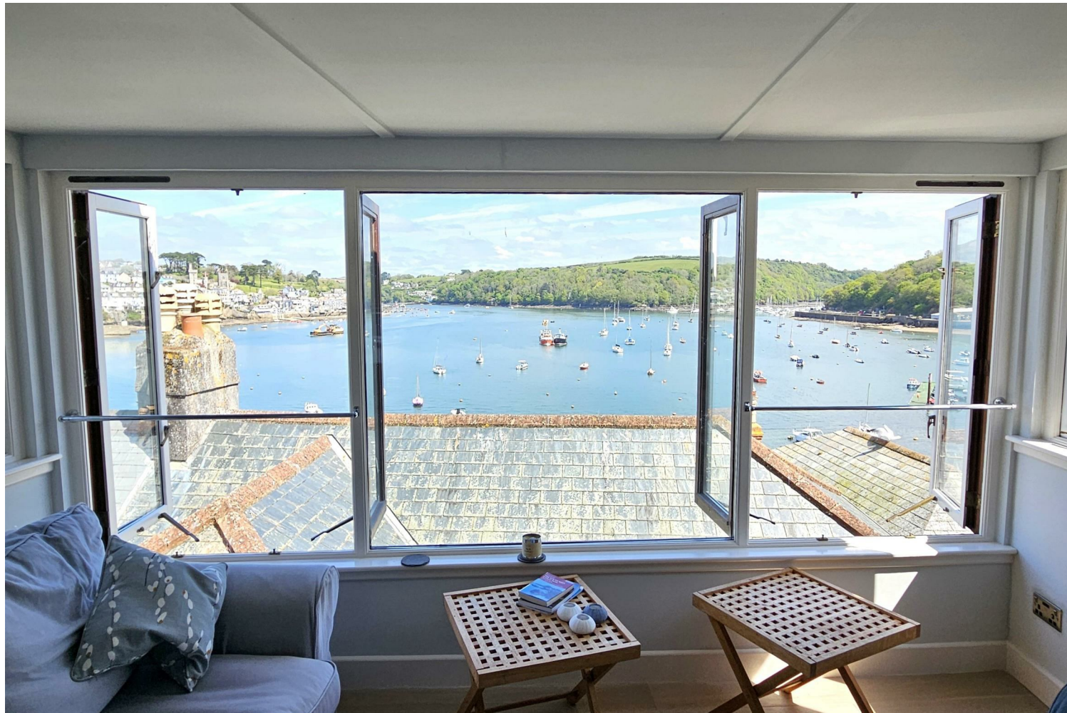
Chapel Ruins, 62 West Street, Polruan, PL23 1PL

Polruan Polruan lies on the east bank of the river Fowey, just inside the entrance to Fowey harbour. The village has its own general stores, sub post office, tea rooms, two public houses and a long established boat building and repair yard. The village is connected to Fowey, which has a wider range of small shops and businesses catering for most day to day needs, by a regular passenger ferry. The immediate area is surrounded by many miles of wonderful coast and countryside, much of which is in the ownership of the National Trust.