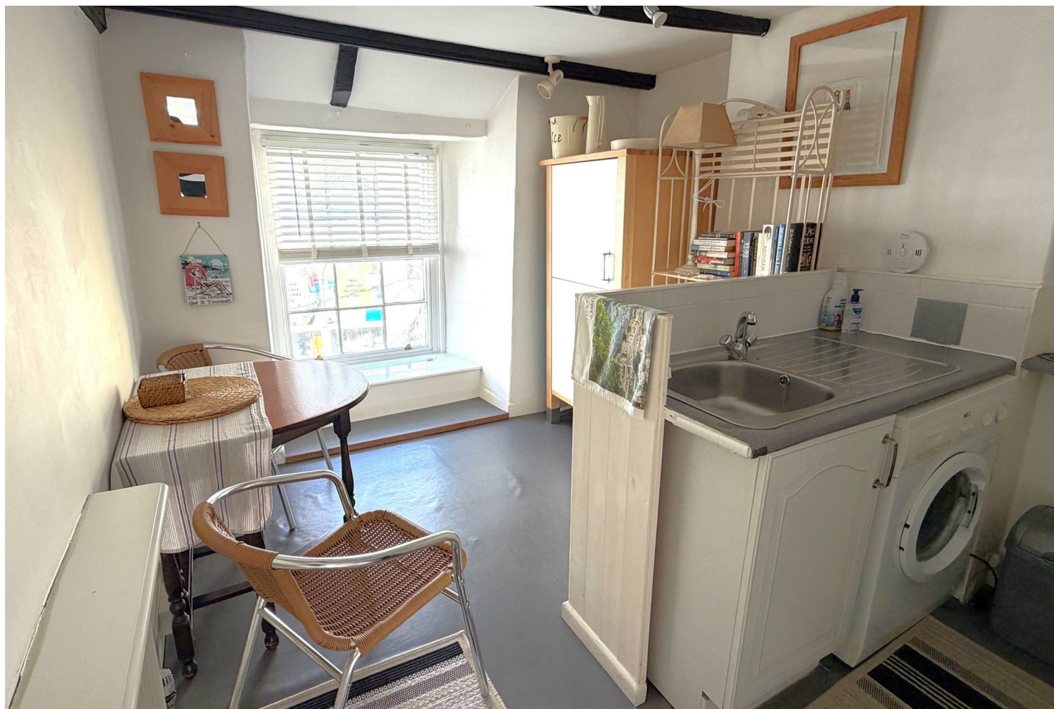
Number 32 Fore Street, Fowey, Cornwall, PL23 1AQ

The Location Fowey is regarded as one of the most attractive waterside communities in the county. Particularly well known as a popular sailing centre, the town has two thriving sailing clubs, a famous annual Regatta and excellent facilities for the keen yachtsman. For a small town Fowey provides a good range of shops and businesses catering for most day to day needs. The immediate area is surrounded by many miles of delightful coast and countryside much of which is in the ownership of the National Trust. Award winning restaurants, small boutique hotels, excellent public houses etc, have helped to establish Fowey as a popular, high quality, destination.