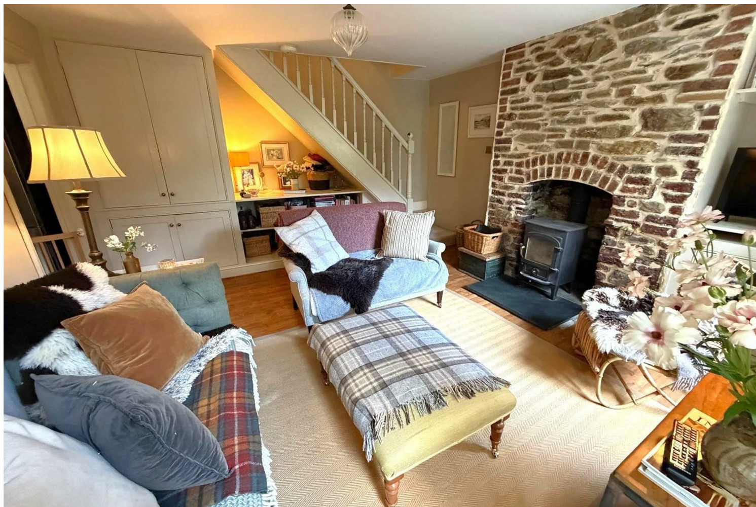
Willow Cottage, 15 Grenville Road, Lostwithiel, PL22 0EP

The Location Formerly the ancient capital of the County, Lostwithiel occupies an attractive valley setting and is regarded as one of Cornwall's most attractive small towns. There is a real sense of community here, with shops for most day to day needs, lovely pubs and restaurants, a doctor's surgery, modern dental surgery, and access to the beautiful waters of the Fowey River. The town also has a main line Railway Station with links to Paddington, London. Two local schools provide education for primary school age children. There are many world class gardens to be found in the immediate area and the fascinating Eden Project with its futuristic biomes is just a few miles away. There are good road links to the motorway system via the A38/A30, and there are flights to London from Newquay.