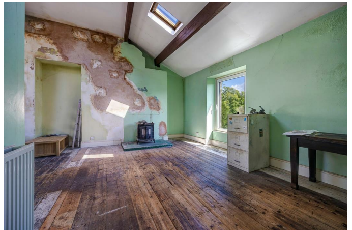
Substantial attic room, floor boards, 2 radiators, fireplace, base units, 1.5 drainer sink, exposed beams, double glazed windows to front and rear aspect, 3 Velux windows.