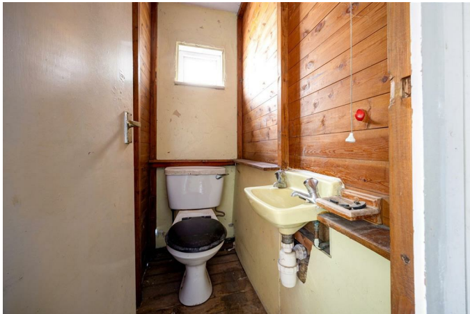
Floor boards, wash basin, toilet, double glazed window to side aspect.