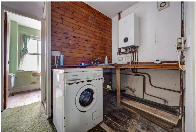
Floor boards, radiator, single drainer sink, boiler, worktop with single drainer sink, washing machine, extractor fan.