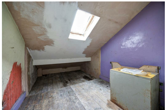
Small attic room with floor boards, Velux window.