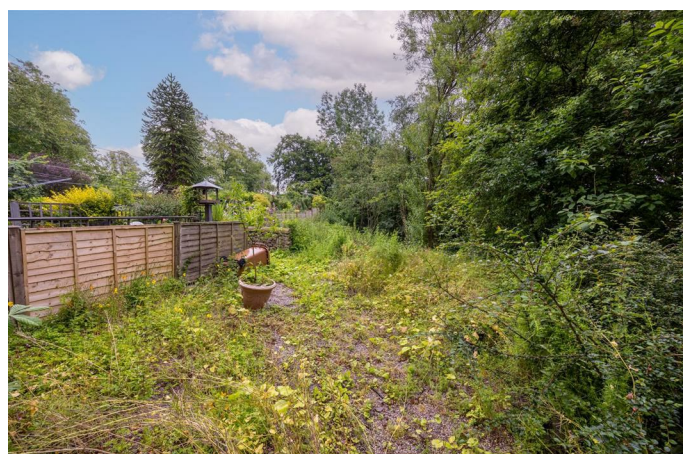
Good sized enclosed garden.