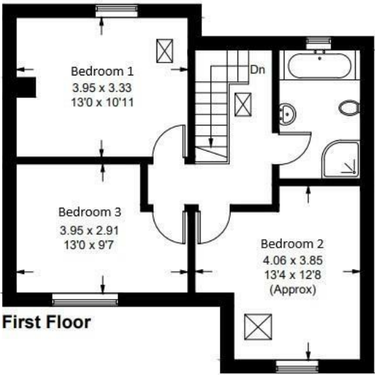
Illustration for identification purposes only, measurements are approximate, not to scale. Fourlabs.co © (ID1228597)