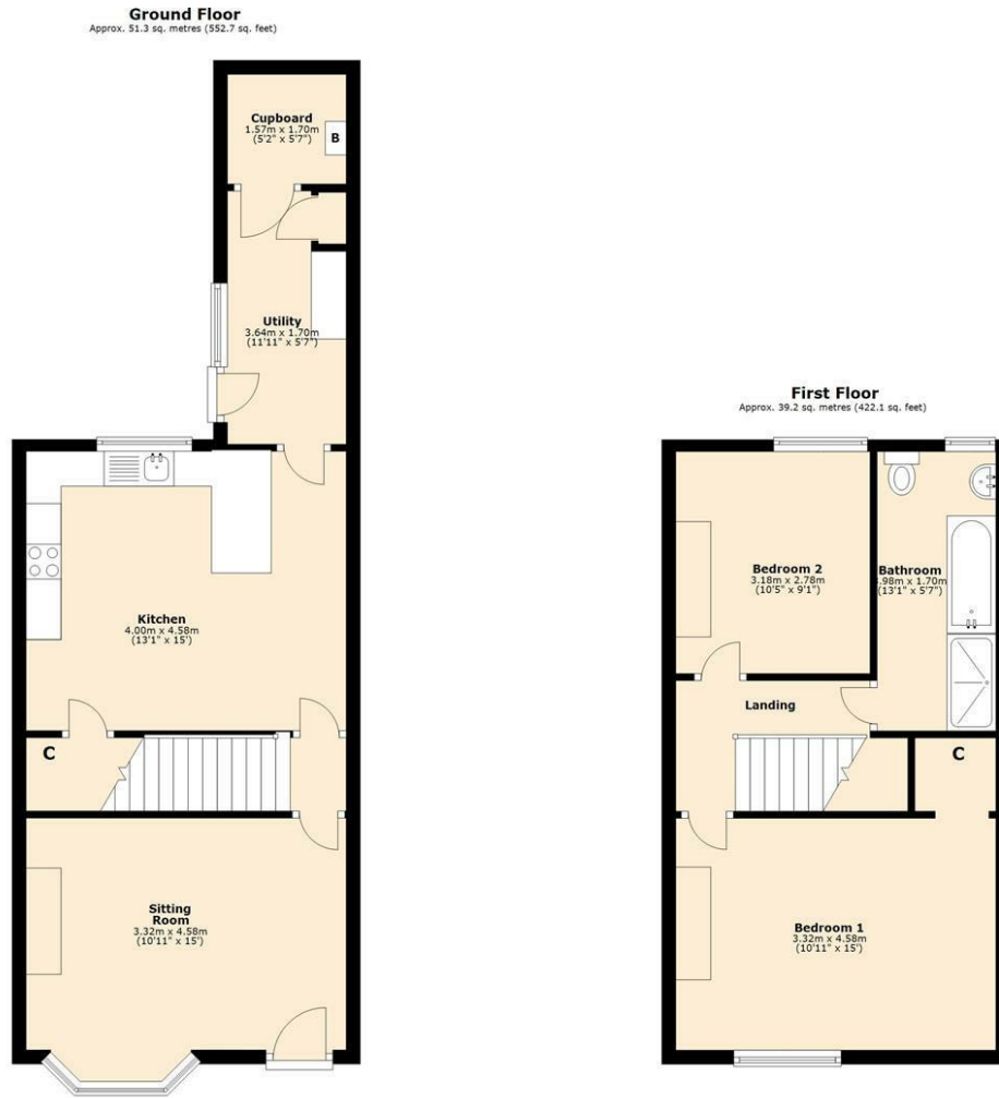
Total area: approx. 90.6 sq. metres (974.8 sq. feet) 3 Lytham Terrace, Ingletton