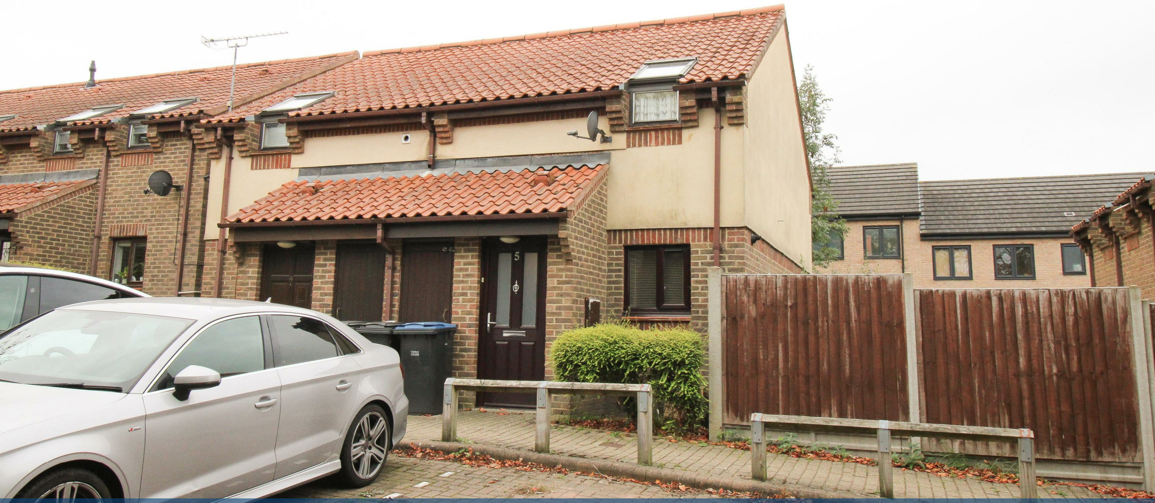
The Briars, Harlow, CM18 7DG Shared ownership £140,000