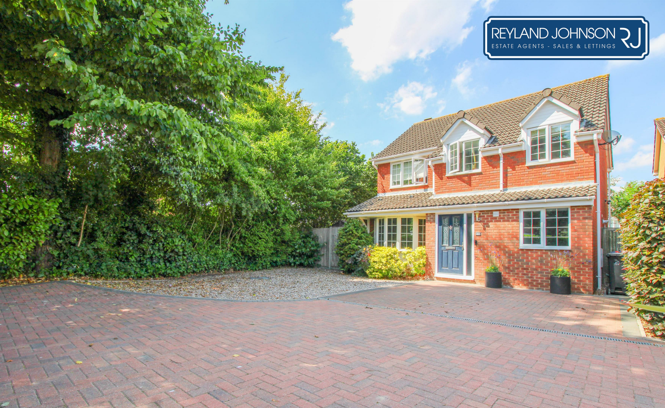
Fenton Grange, Church Langley, CM17 9PG £600,000