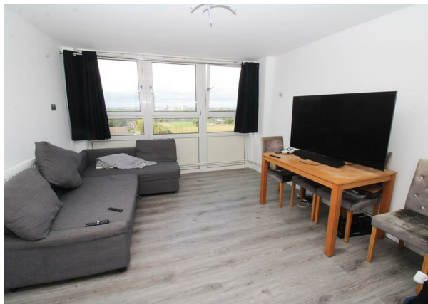
12TH FLOOR 510 sq.ft. (47.3 sq.m.) approx.