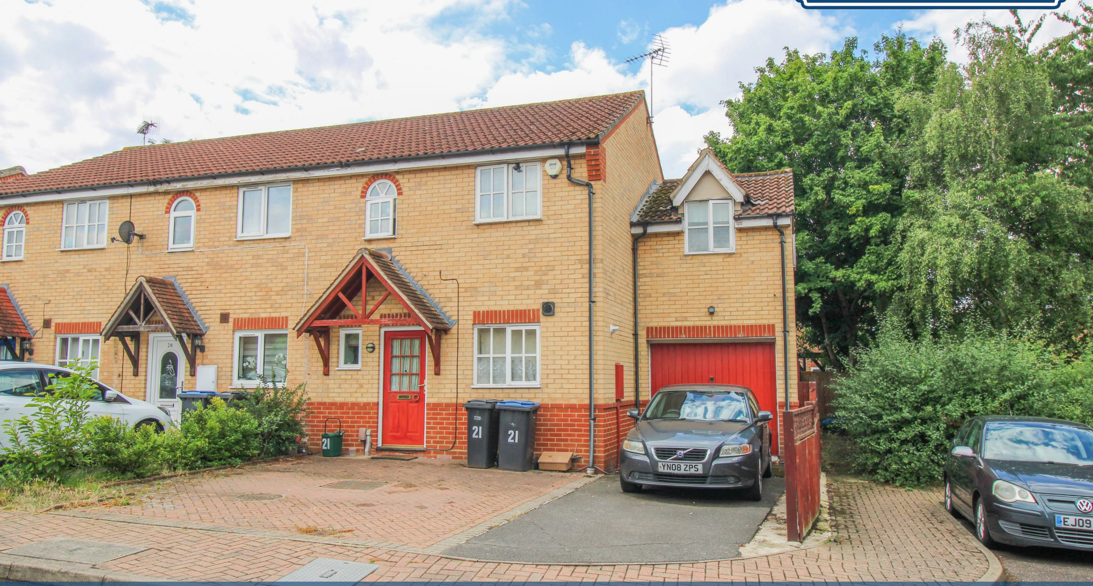
Denby Grange, Church Langley, CM17 9PZ Guide Price £400,000