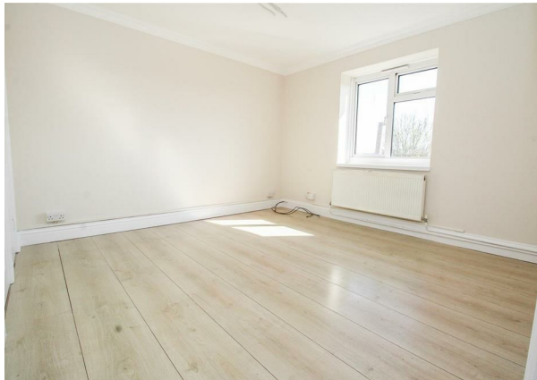
FIRST FLOOR 331 sq.ft. (30.8 sq.m.) approx.