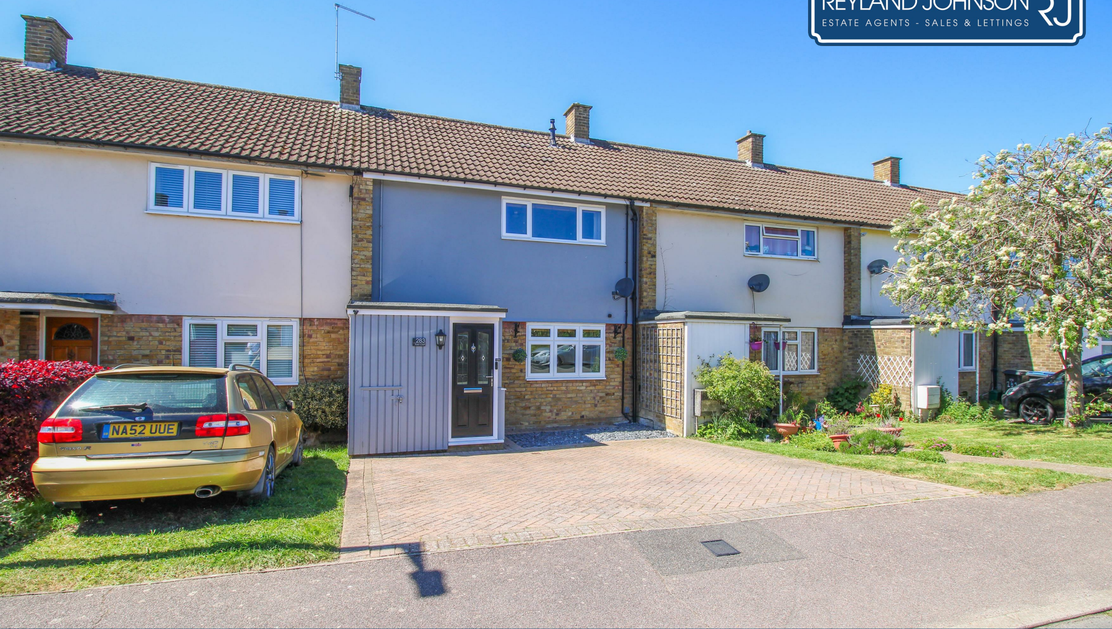
Fold Croft, Harlow, CM20 1SE Guide Price £325,000