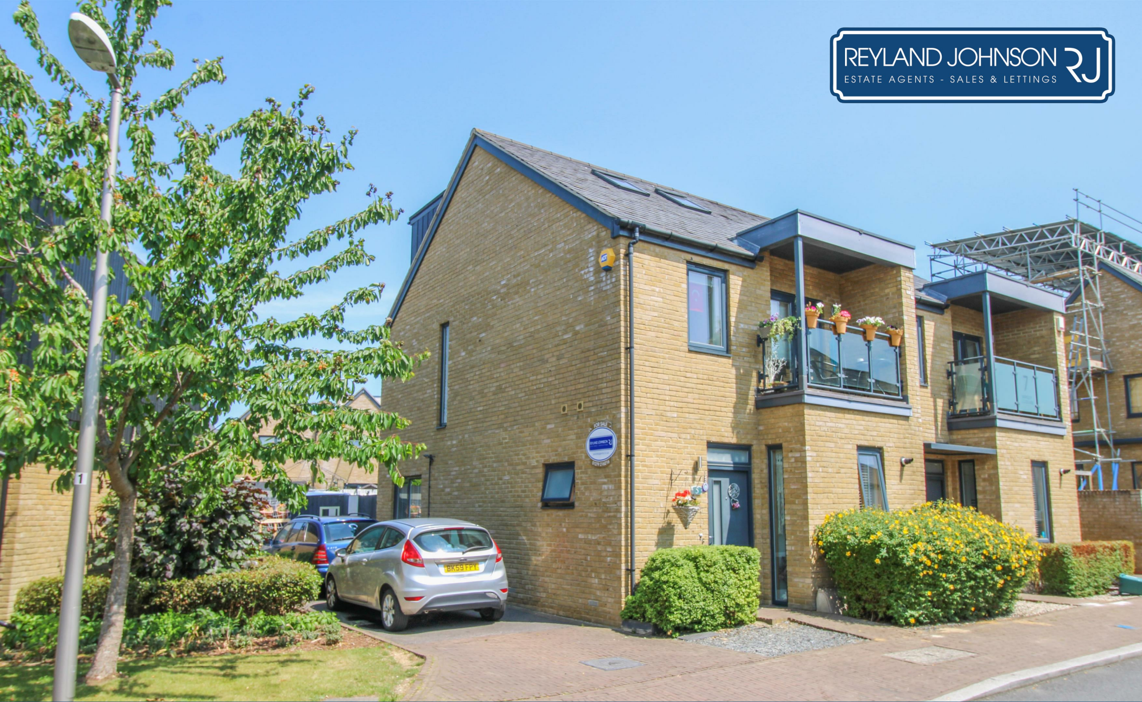
Barnsley Wood Rise, Harlow, CM17 9GG Guide Price £450,000