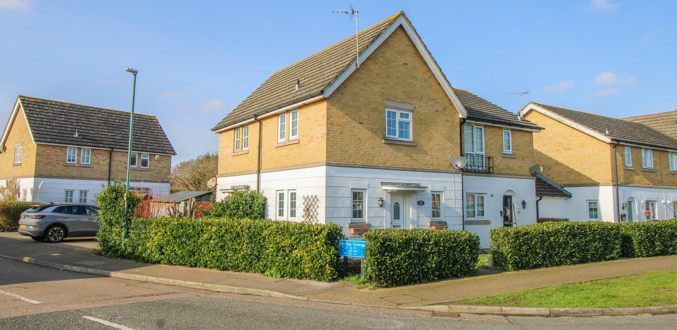
Hadley Grange, Church Langley, CM17 9PQ Guide Price £250,000