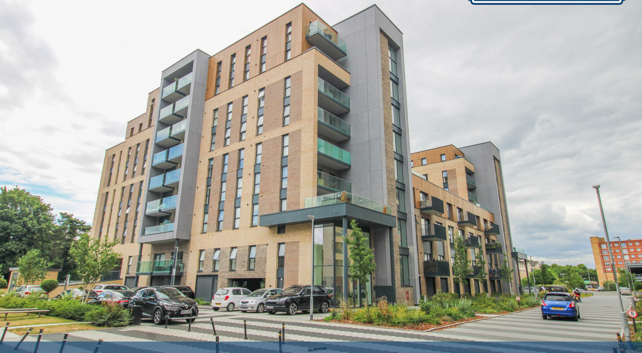
Hepworth House, Harlow, CM20 2UB £350,000