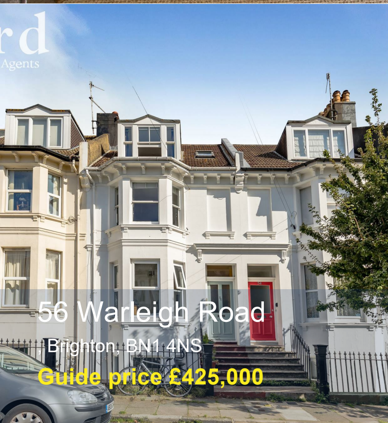
56 Warleigh Road Brighton, BN1 4NS Guide price £425,000