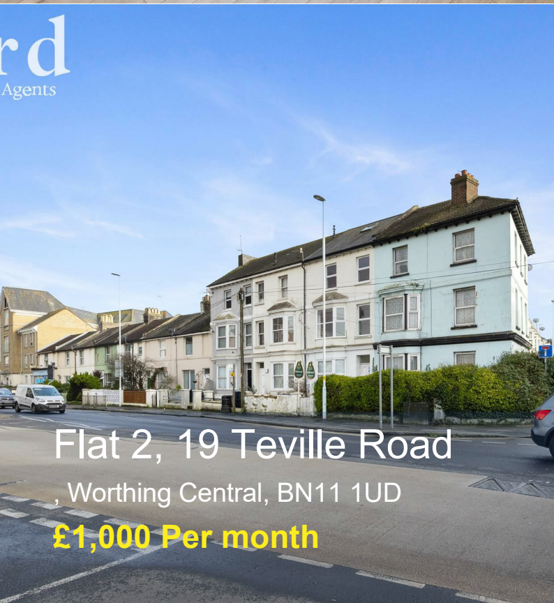
Flat 2, 19 Teville Road , Worthing Central, BN11 1UD £1,000 Per month