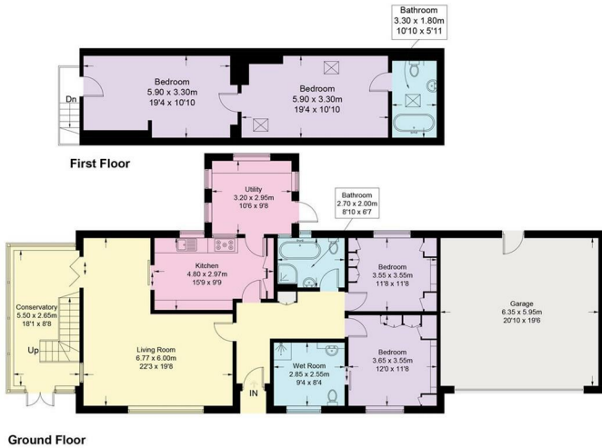
Illustration for identification purposes only, measurements are approximate, not to scale. Fourlabs.co © (ID1296240)

Approximate Gross Internal Area = 166.8 sq m / 1795 sq ft Garage = 37.9 sq m / 408 sq ft Total = 204.7 sq m / 2203 sq ft