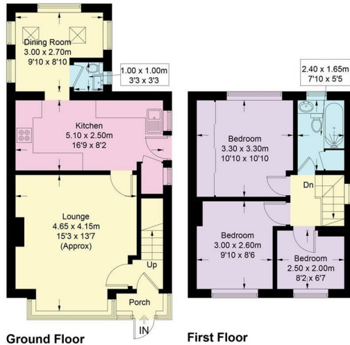
Illustration for identification purposes only, measurements are approximate, not to scale. Fourlabs.co © (ID1155326)

Approximate Gross Internal Area = 77.6 sq m / 835 sq ft