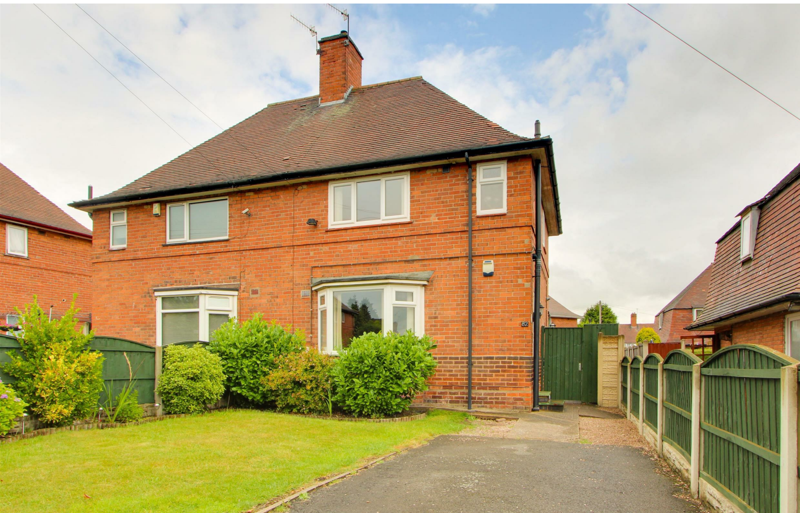
Harmston Rise, Basford, Nottinghamshire NG5 1NQ