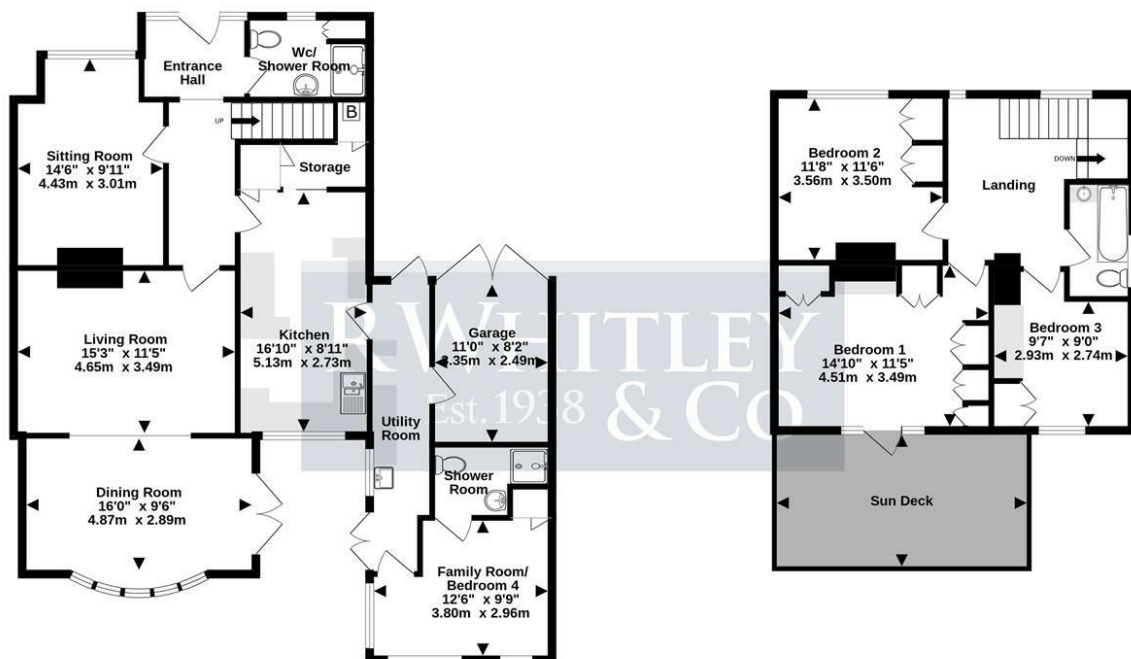
FIRST FLOOR 544 sq.ft. (50.5 sq.m.) approx.

TOTAL FLOOR AREA: 1679 sq.ft. (156.0 sq.m.) approx.