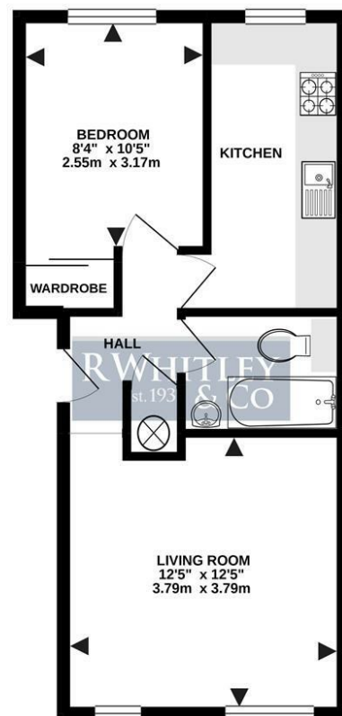
TOTAL FLOOR AREA : 412 sq.ft. (38.3 sq.m.) approx.

Whilst every attempt has been made to ensure the accuracy of the floorplan contained here, measurements of doors, windows, rooms and any other items are approximate and no responsibility is taken for any error, omission or mis-statement. This plan is for illustrative purposes only and should be used as such by any prospective purchaser. The services, systems and appliances shown have not been tested and no guarantee as to their operability or efficiency can be given. Made with Metropix ©2021