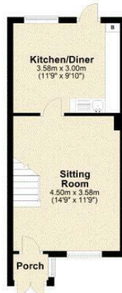
Ground Floor Approx. 26.3 sq. metres (284.8 sq. feet)