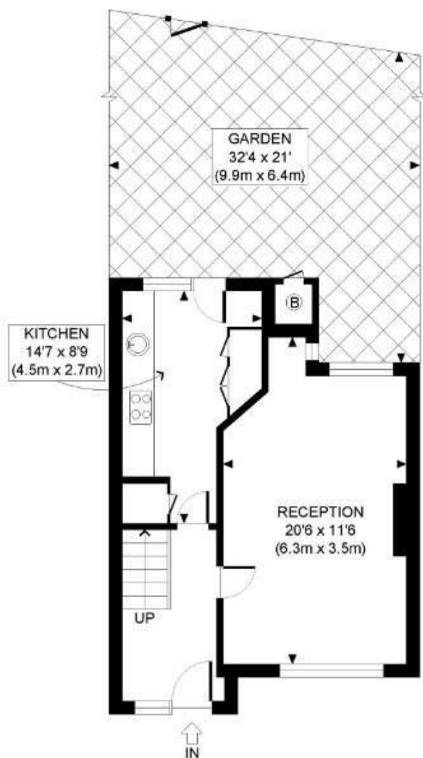
GROUND FLOOR GROSS INTERNAL FLOOR AREA 391 SQ FT