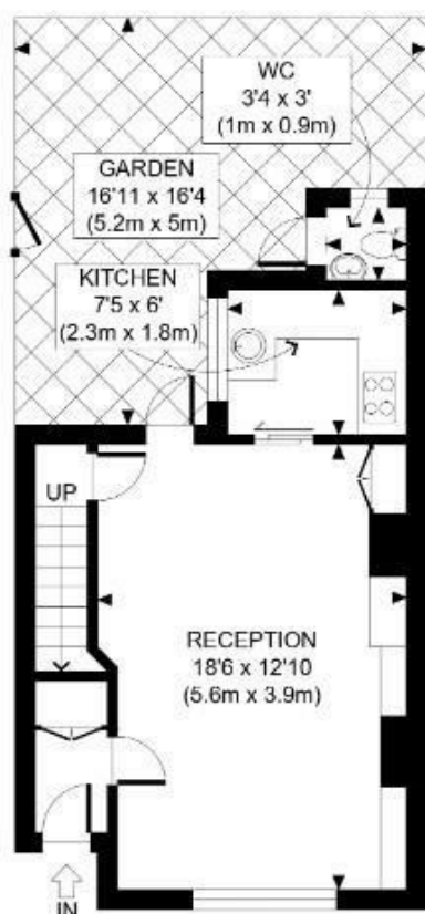
GROUND FLOOR GROSS INTERNAL FLOOR AREA 336 SQ FT