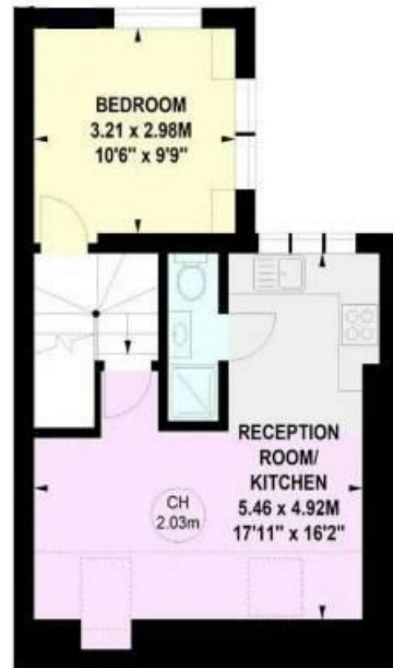
Second Floor Entrance