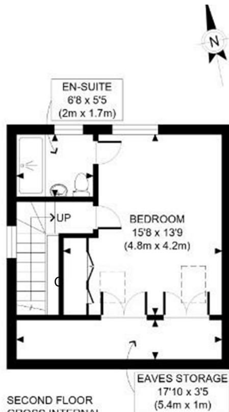
SECOND FLOOR GROSS INTERNAL FLOOR AREA WITH EAVES STORAGE 348 SQ FT FLOOR AREA WITHOUT EAVES STORAGE 279 SQ FT