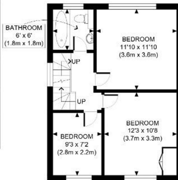
FIRST FLOOR GROSS INTERNAL FLOOR AREA 447 SQ FT

APPROX. GROSS INTERNAL FLOOR AREA WITH EAVES STORAGE: 1435 SQ FT/ 133 SQM APPROX. GROSS INTERNAL FLOOR AREA WITHOUT EAVES STORAGE: 1214 SQ FT/ 113 SQM