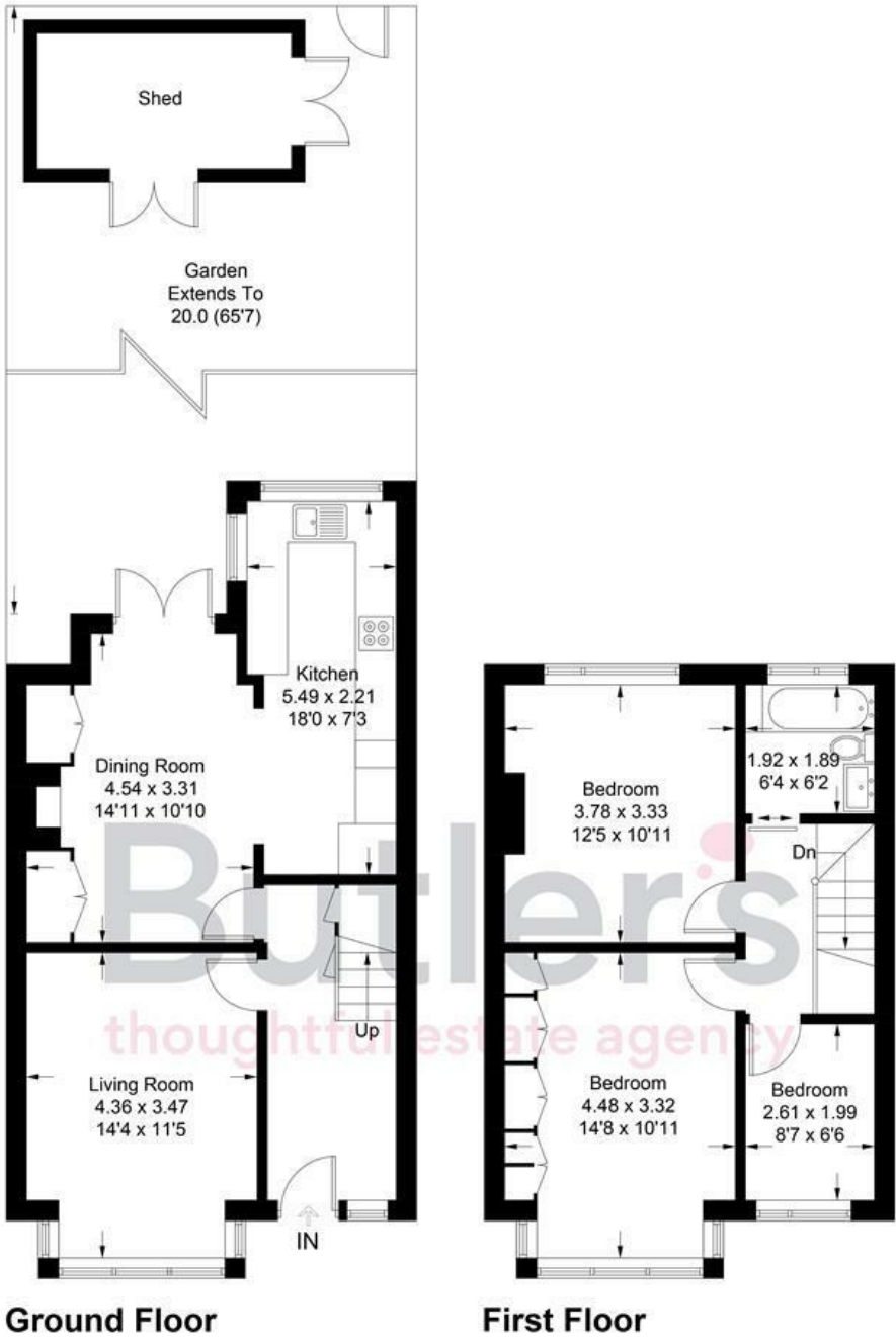
Illustration for identification purposes only, measurements are approximate, not to scale. Fourlabs.co © (ID1213398)

These particulars, whilst believed to be accurate are set out as a general outline only for guidance and do not constitute any part of an offer or contract. Intending purchasers should not rely on them as statements of representation of fact, but must satisfy themselves by inspection or otherwise as to their accuracy. No person in this firms employment has the authority to make or give any representation or warranty in respect of the property.