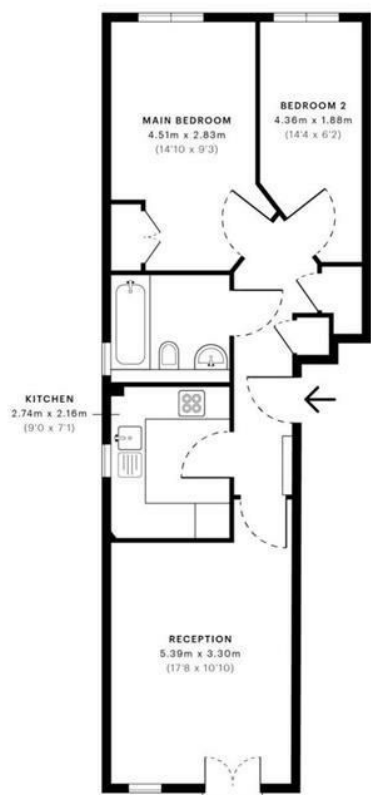
— First Floor

GROSS INTERNAL AREA 53.21 sqm / 572.75 sqft