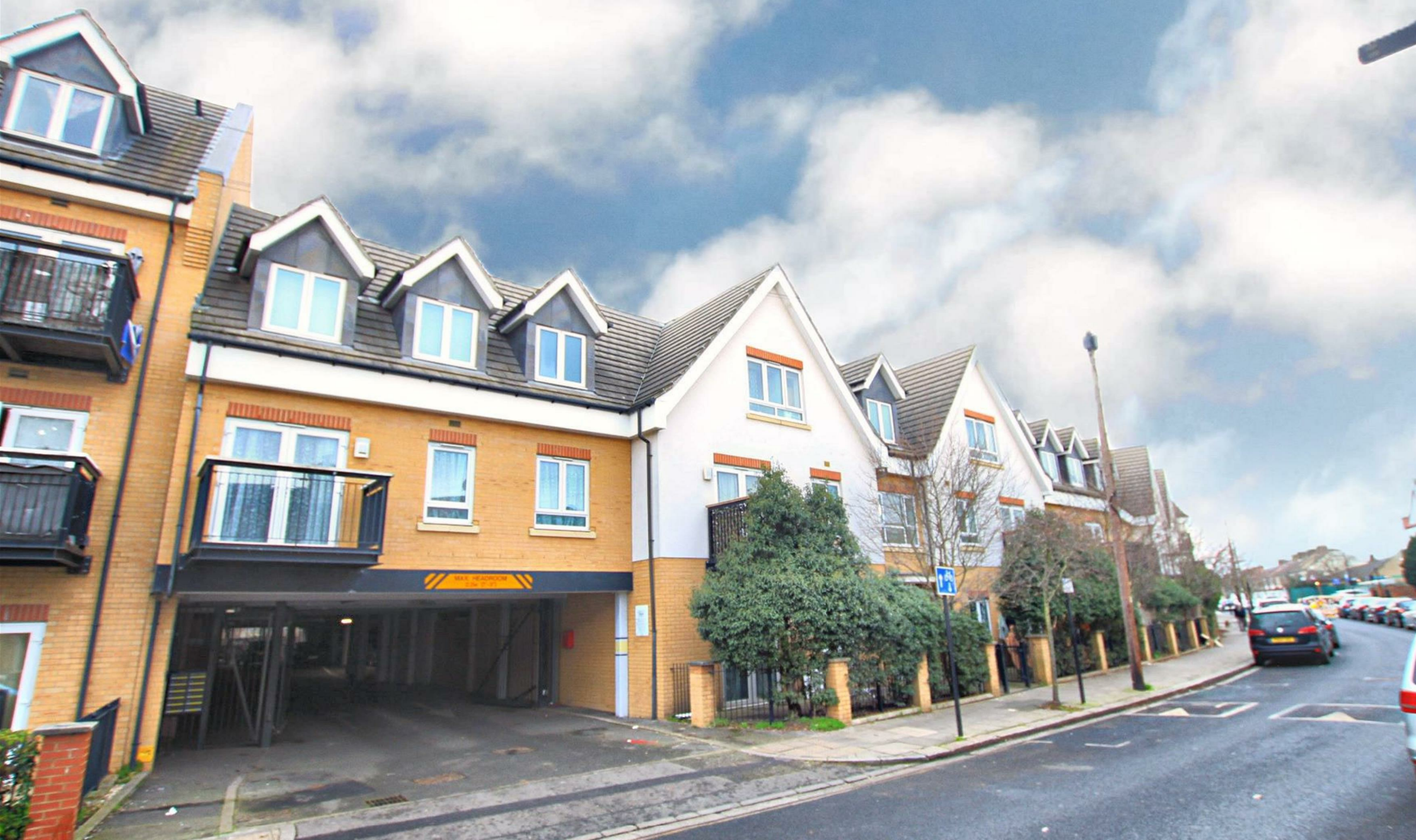
Featherstone Court, Southall, UB2 5GQ Guide Price £230,000