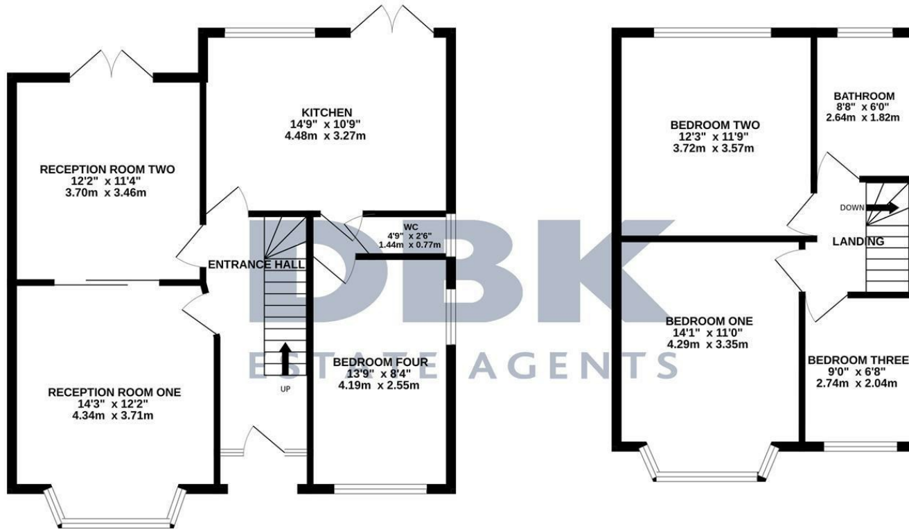
1ST FLOOR 446 sq.ft. (41.5 sq.m.) approx.

TOTAL FLOOR AREA : 1134 sq.ft. (105.4 sq.m.) approx.