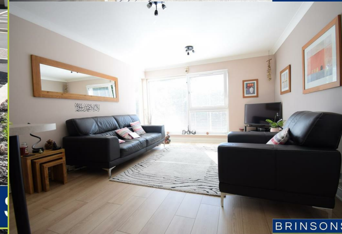
Flat D Castle Manor, Caerphilly, CF83 1BW £190,000