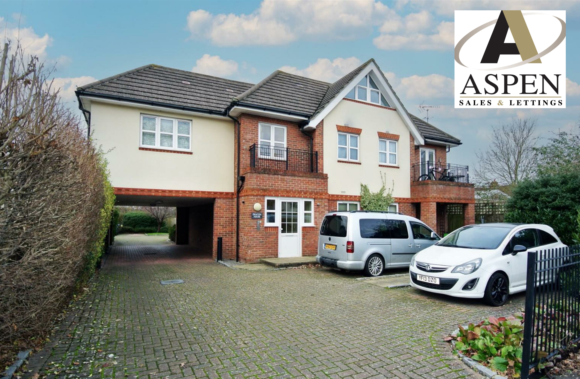
7 Deacon House 16-18 Littleton Road, Ashford, TW15 1UQ