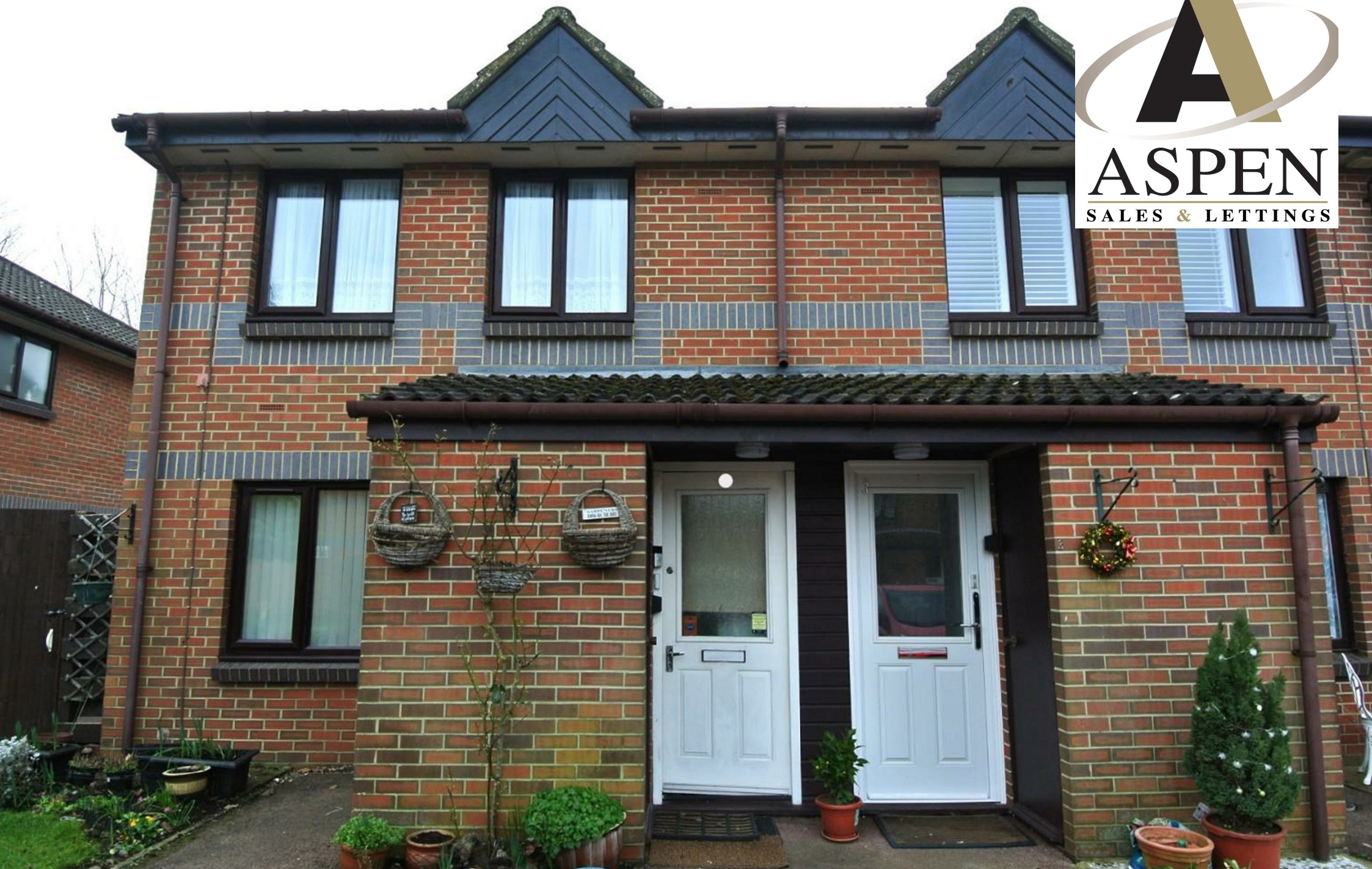
Flat 2 Berryscroft Berryscroft Road, Staines-Upon-Thames, TW18 1NA