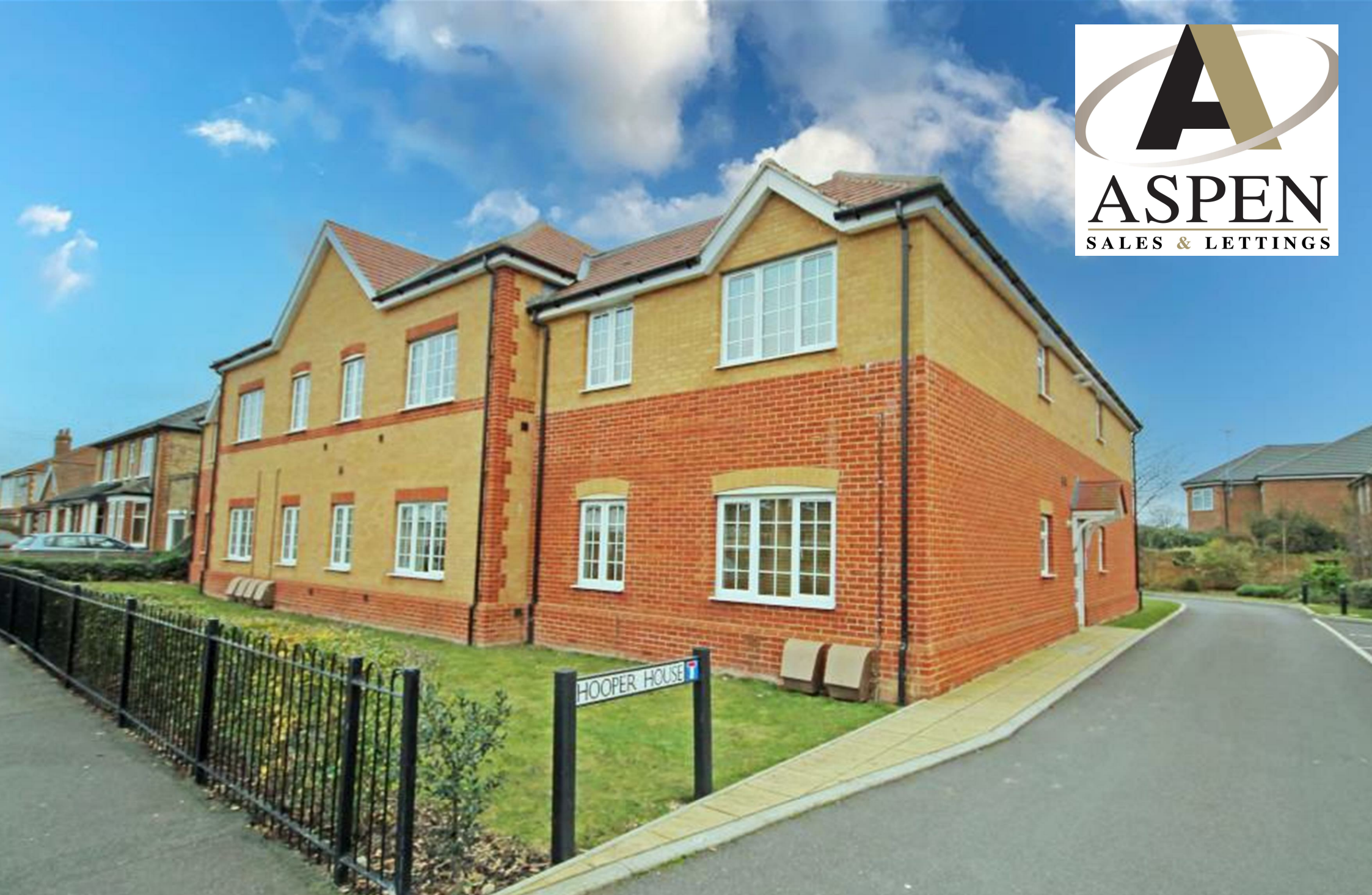
1 Hooper House, Ashford Crescent, Ashford, TW15 3GN