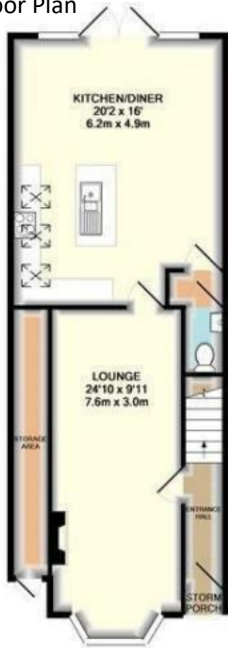
GROUND FLOOR APPROX. FLOOR AREA 690 SQ.FT. (64.1 SQ.M.)