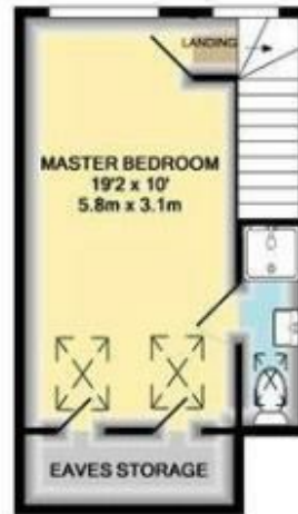
2ND FLOOR APPROX. FLOOR AREA 286 SQ.FT. (26.6 SQ.M.)

TOTAL APPROX. FLOOR AREA 1399 SQ.FT. (130.0 SQ.M.)