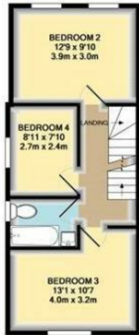
1ST FLOOR APPROX. FLOOR AREA 423 SQ.FT. (39.3 SQ.M.)