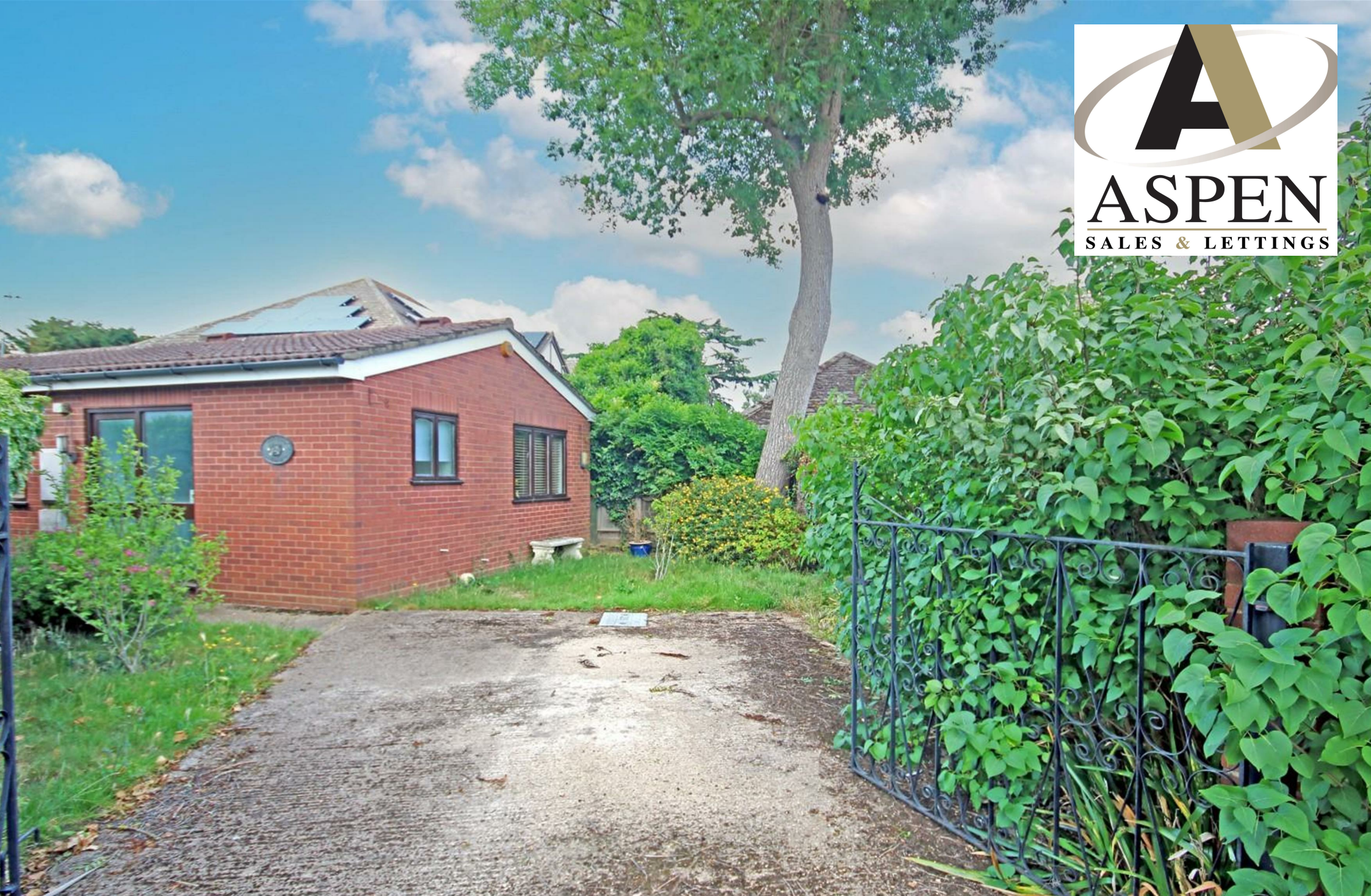
Magnolia Lodge 2 The Crescent, Ashford, TW15 2SU