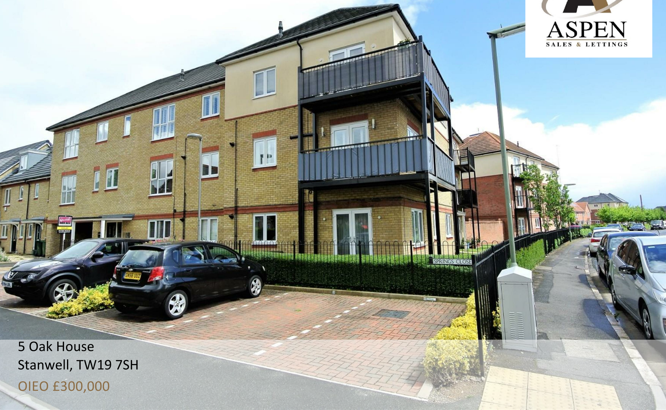
5 Oak House Stanwell, TW19 7SH OIEO £300,000