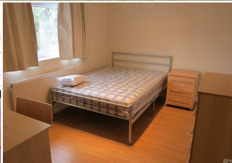
8 Linden Court, Egham, TW20 0TG

This is a lovely 5 bed student house, recently refurbished and painted in the last 3 years. The property compromises 2 large doubles, 2 smaller doubles and 1 single bedrooms. It has 1 bathrooms plus a downstairs w.c. EPC Rating: D