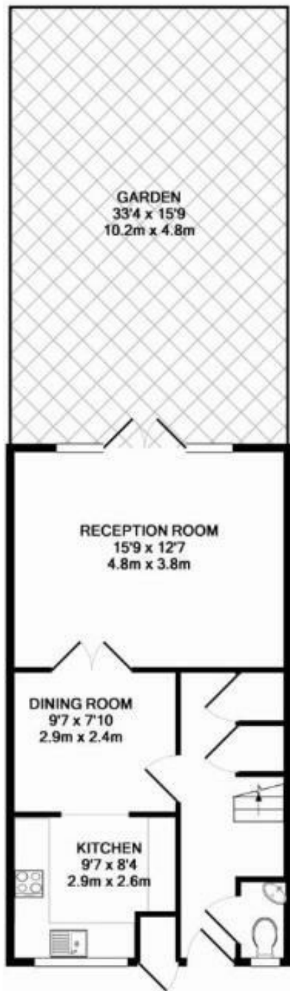
GROUND FLOOR APPROX. FLOOR AREA 42.8 SQ.M. (460 SQ.FT.)