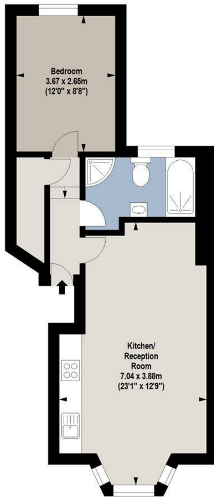
Raised Ground Floor