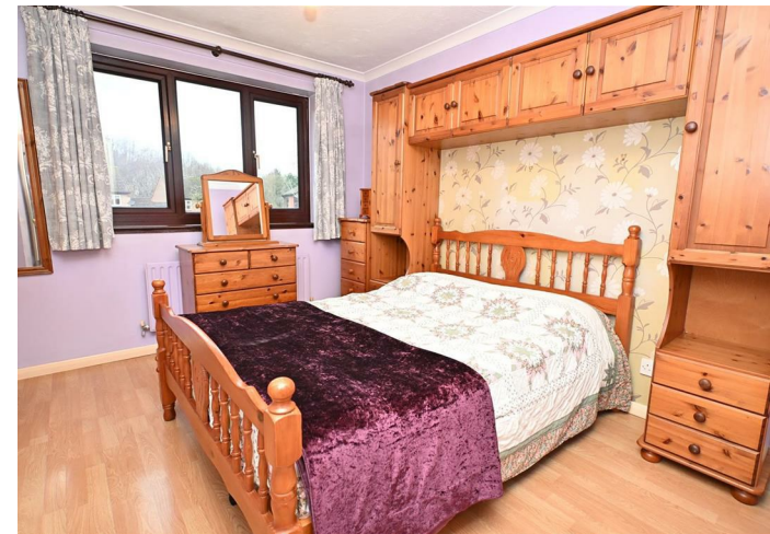
2 BED TERRACED

Whilst every attempt has been made to ensure the accuracy of the information contained here, measurements of doors, windows, rooms and an omission or mis-statement. This prospective purchaser. The service 49-16