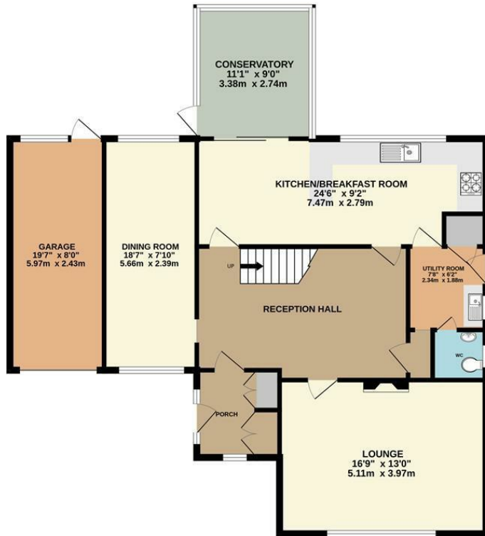
GROUND FLOOR 1189 sq.ft. (110.5 sq.m.) approx.