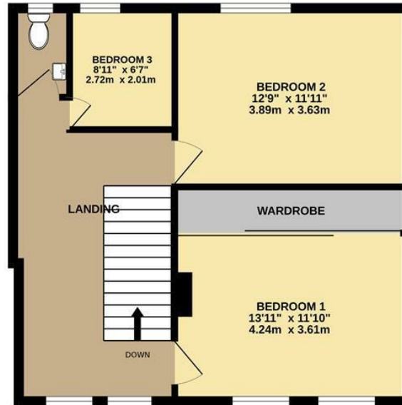
TOTAL FLOOR AREA : 1188 sq.ft. (110.4 sq.m.) approx.

Whilst every attempt has been made to ensure the accuracy of the floorplan contained here, measurements of doors, windows, rooms and any other items are approximate and no responsibility is taken for any error, omission or mis-statement. This plan is for illustrative purposes only and should be used as such by any prospective purchaser. The services, systems and appliances shown have not been tested and no guarantee as to their operability or efficiency can be given.