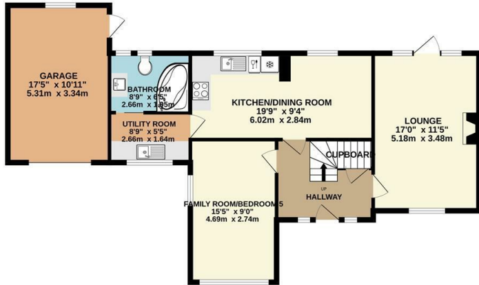
GROUND FLOOR 892 sq.ft. (82.9 sq.m.) approx.