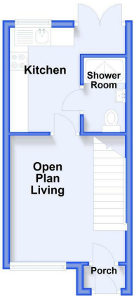
Ground Floor Approx. 26.4 sq. metres (284.7 sq. feet)