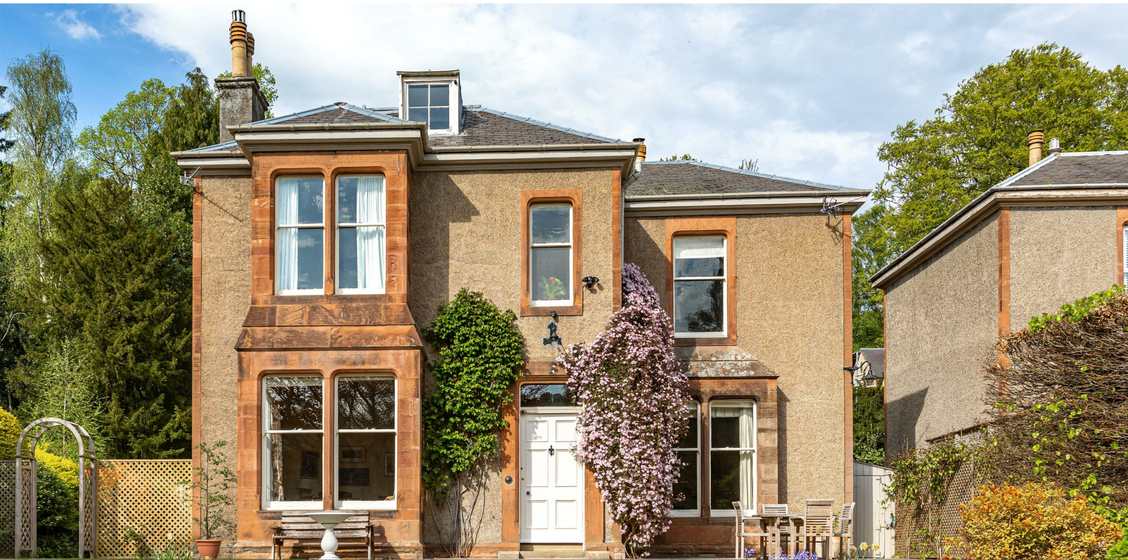
Roxburgh House, Melrose Road, Galashiels, TD1 2AY