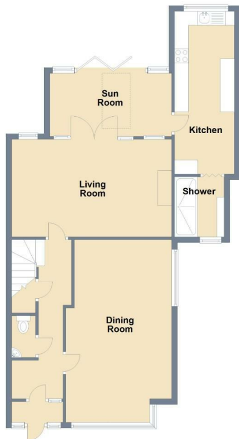
Ground Floor Approx. 84.0 sq. metres (904.0 sq. feet)