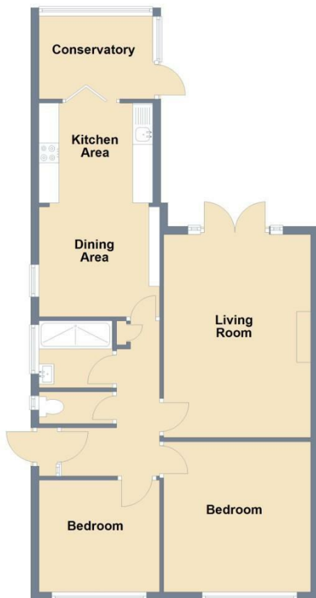
Total area: approx. 76.1 sq. metres (818.9 sq. feet)