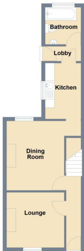
Ground Floor Approx. 39.2 sq. metres (421.5 sq. feet)